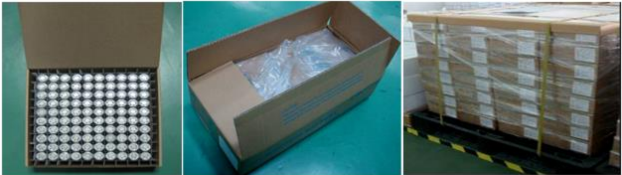
Small box 小箱